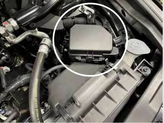
Pressure sensor location (Channel 2)