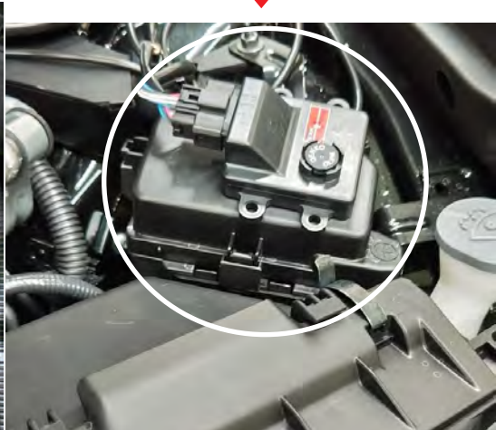
Connect the harness of Power Editor