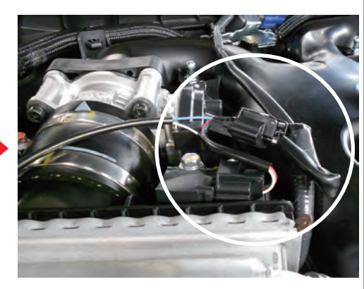
Direction of view