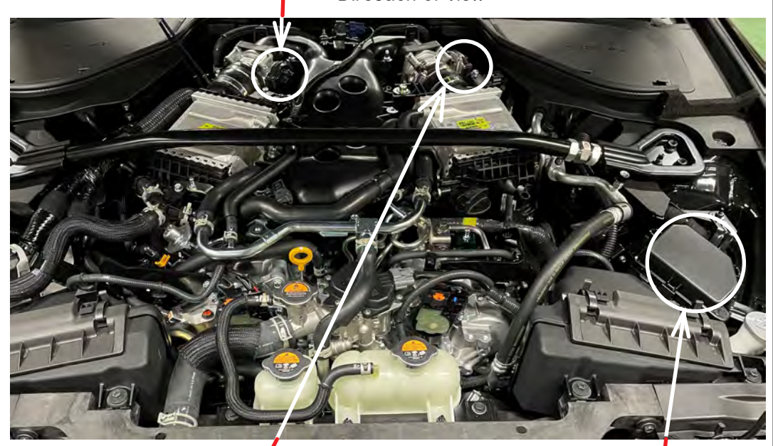
Direction of view