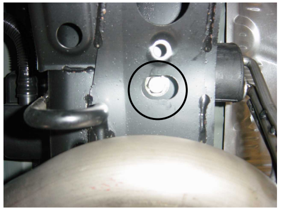
Underside - Rear of Vehicle to right of image